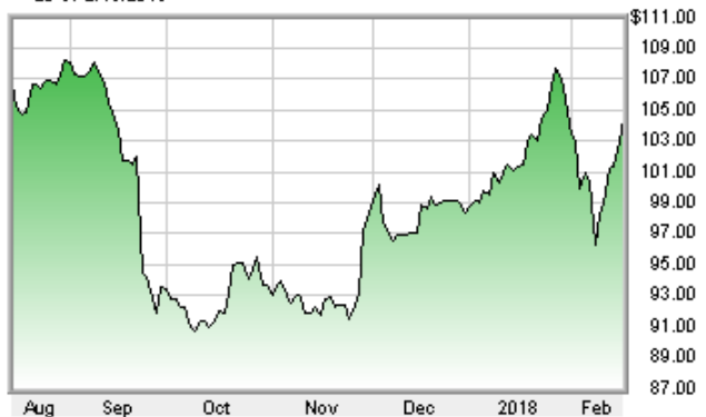
■ QUEST DIAGNOSTICS INC as of 2/16/2018