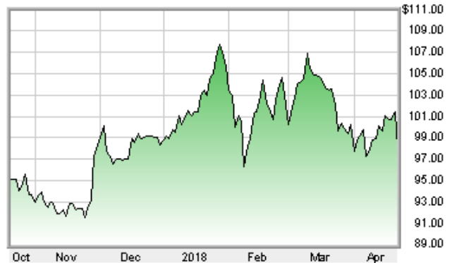
■ QUEST DIAGNOSTICS INC as of 4/20/2018