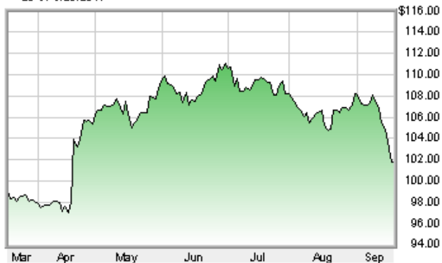
■ QUEST DIAGNOSTICS INC as of 9/20/2017