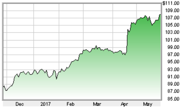
■ QUEST DIAGNOSTICS INC as of 5/26/2017